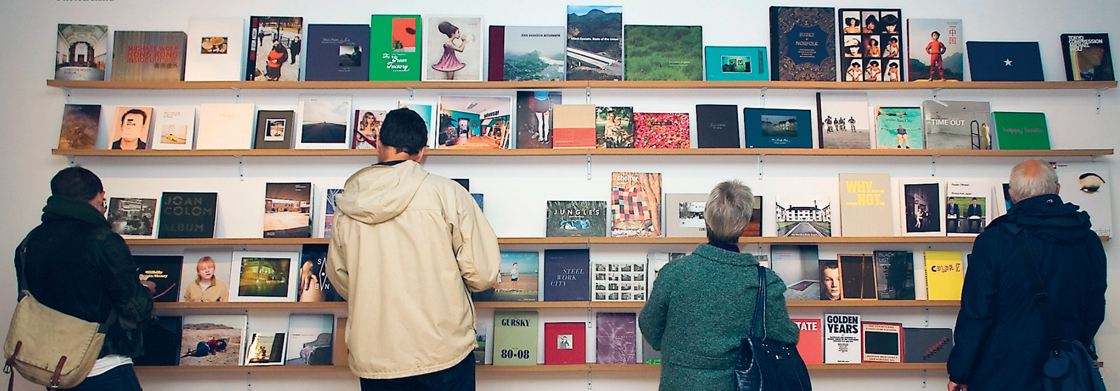
The Library Project, PhotoIreland

The following galleries, publishers and institutions will be selling new and old photobooks: Lodret Vandret, Galleri Image, SPACE POETRY, Banja Rathnow Kunsthandel, ARCHITEGN, Archipelaget, Det Jyske Kunstakademi.